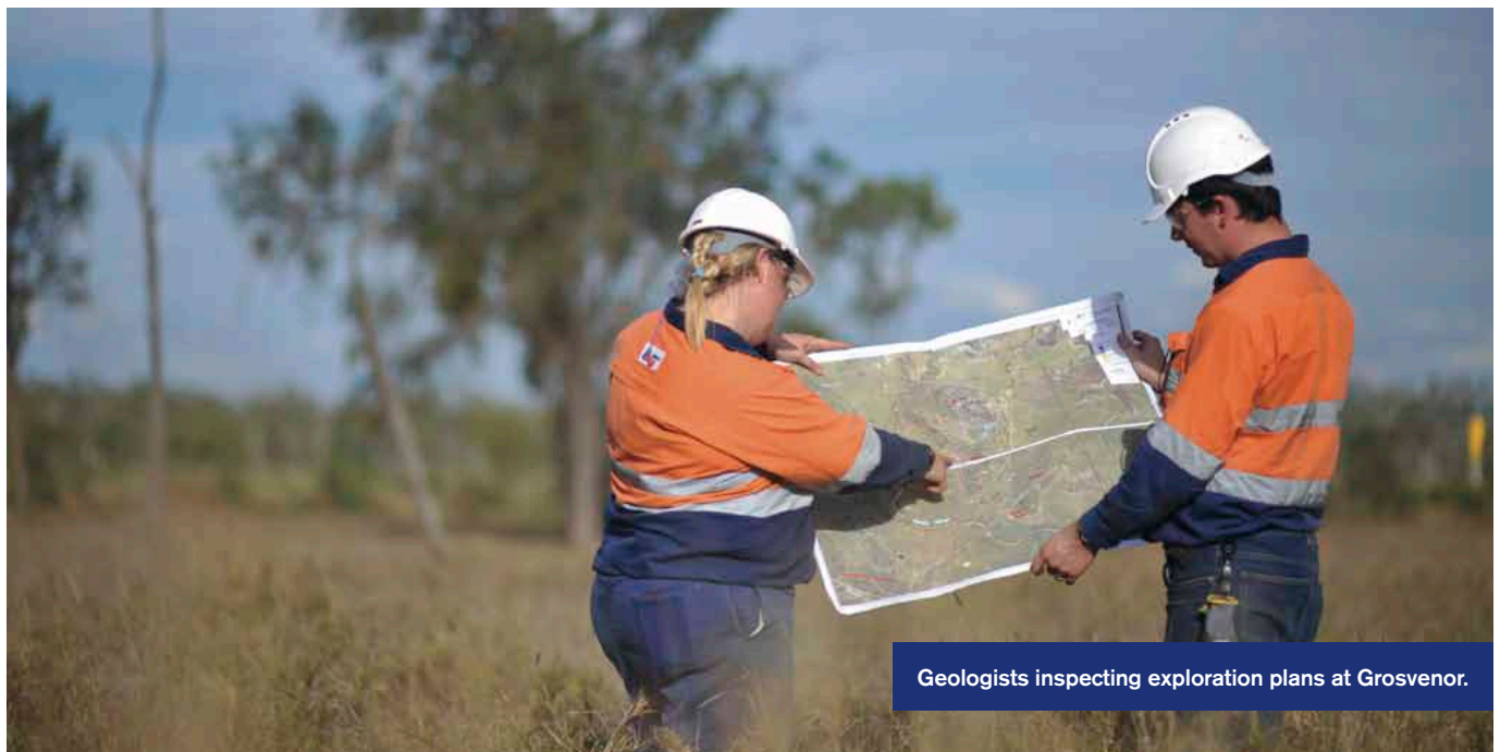
Geologists inspecting exploration plans at Grosvenor.