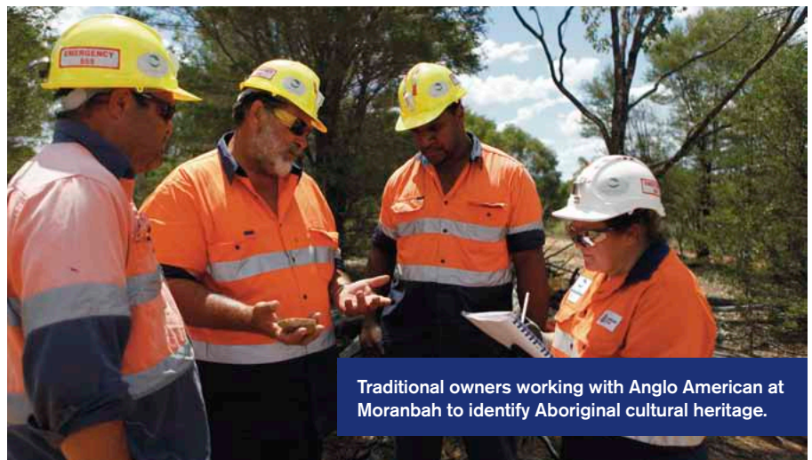
Traditional owners working with Anglo American at Moranbah to identify Aboriginal cultural heritage.

Our licence to operate is determined by Anglo American being the partner of choice for our neighbours and other stakeholders, and this is achieved by us working closely with our local communities and all levels of