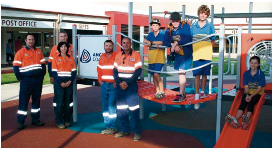
ACA's Capcoal Management funded a shopping centre upgrade at Middlemount, which included a new playground and was completed in August 2009.

ACA is Australia's fourth biggest coal producer and the third largest exporter of metallurgical coal in the country. With operations based in Callide, Capcoal, Dartbrook, Dawson, Drayton, Foxleigh and Moranbah North, ACA is committed to being a socially responsible company. ACA values its neighbouring communities and strategically identifies ways to contribute meaningfully to the sustainable development of these communities.