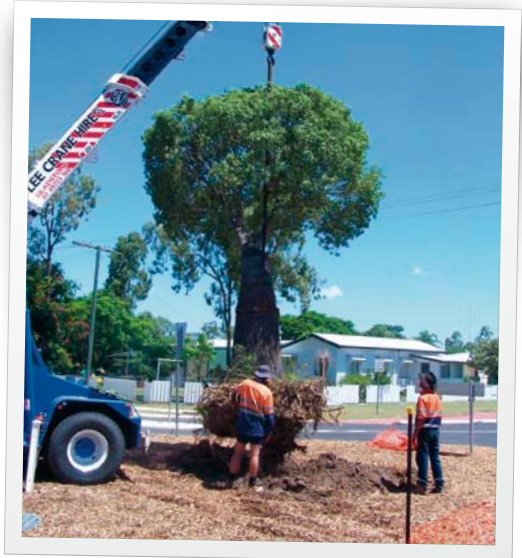
Dawson Mine's bottle tree donation in Moura.