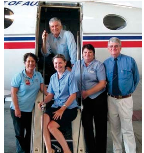
The RFDS received $15,000 as part of Dawson's 2008 Christmas Sponsorship Program.