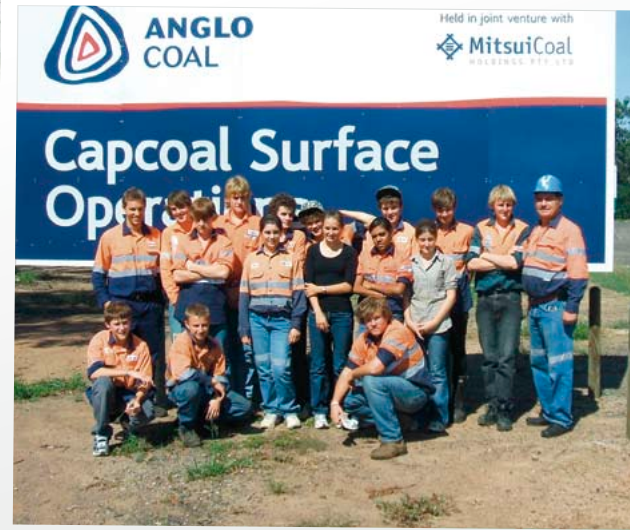
Middlemount High School students on site at Capcoal.