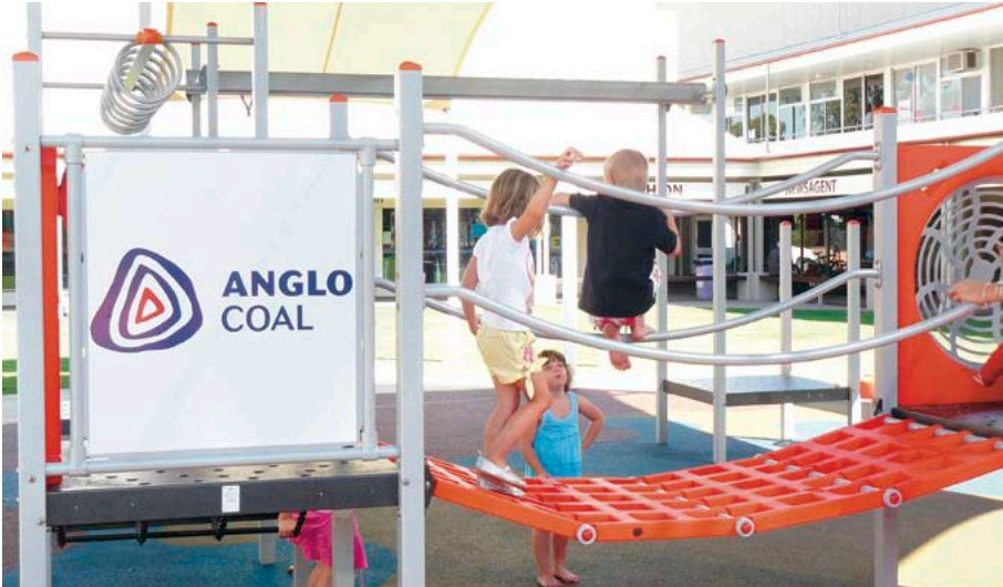
In August 2009 Middlemount children tried out the new playground at a welcome morning tea for new Anglo families.

Engagement with local stakeholders enables ACA to identify local initiatives and projects it can invest in, and deliver on community expectations.