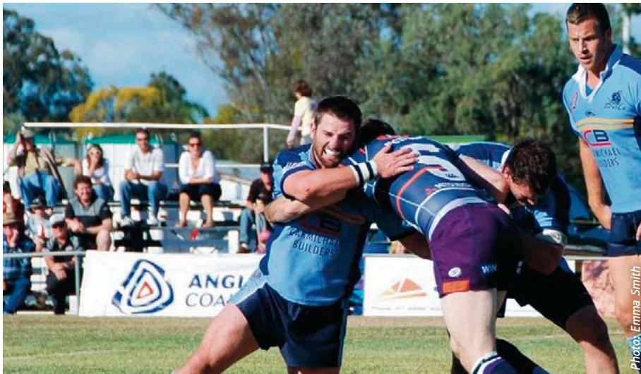
Anglo Coal and the Biloela Panthers hosted the North Devils and Queensland Comets football game on 18 July 2009.

Annually ACA allows funding to be set aside for events that may not directly align with the sponsorship policy, but are still seen as valued contributions to local communities. An example of this is ACA's support of a selection of youth sporting activities and events that have been identified as areas of importance by local stakeholders.