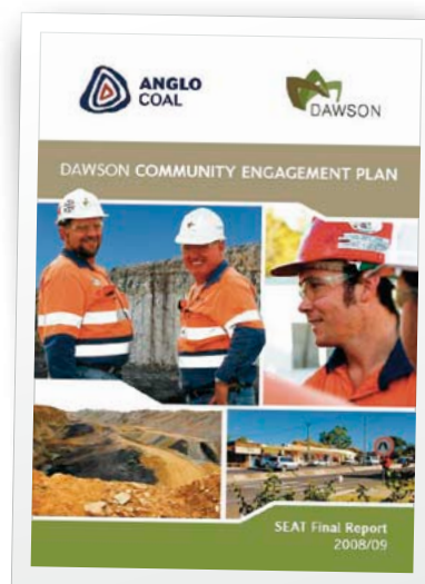
In 2009 Anglo's Dawson and Drayton Mines completed the SEAT process and reported the findings to its key stakeholders.

ACA's Drayton Mine in the Hunter Valley also completed their SEAT report in 2009. Following consideration of the community consultation findings and priority areas, Drayton has developed objectives, management responses and set Key Performance Indicators to address each priority area identified by the local Muswellbrook community. Drayton will use these objectives and management responses to further refine their Community Engagement Action Plan in 2009–2010.